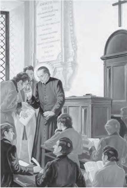
As Professore Supplente at the Sapienza

exemplary childhood sanctity seems exaggerated to the reader, he is asked to review the following facts: At age four, little Vincent's mother witnessed him stray from her side to kneel in front of a statue of the Blessed Virgin, Whom he told "Dear Mother, make me a good boy!" In succeeding years, he became so reputed for his virtue that he earned the name, Il Santerello ("the Little Saint"). Children who played with Vincent found themselves instructed in the catechism and in praying the Rosary by their friend. He gave away his shoes, his clothing, his food, and even his bed to the poor, always doing so out of a spirit of Christian charity. With the bed gone, sleeping on the floor satisfied