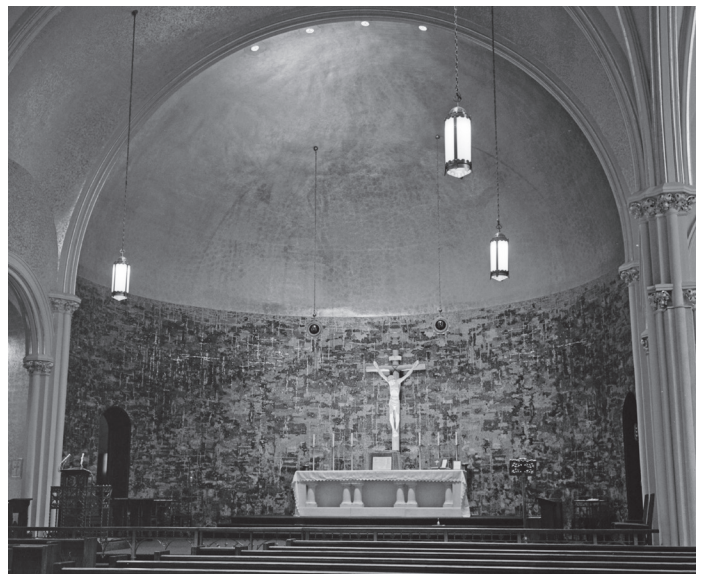
Figure 4. Close-up of the high altar in 1965. "More renovations were made under the leadership of Msgr. G. Warren Peek, 1964–1993. Windows were covered and the apse was repainted gold. The high altar, reredos, marble angels, side altars and Communion rails were all removed. The sanctuary was extended, a simple, freestanding altar was added, and the first several rows of pews were rearranged" ( Detroit Church Blog , September 21, 2017).