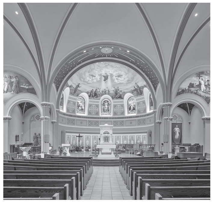
Figure 5. Restoration in 2020 by Conrad Schmitt Studios.

about retiring the architecture, art, and music together with the liturgy that inspired it, and one cannot imagine that they would want to deny the faithful that beauty.