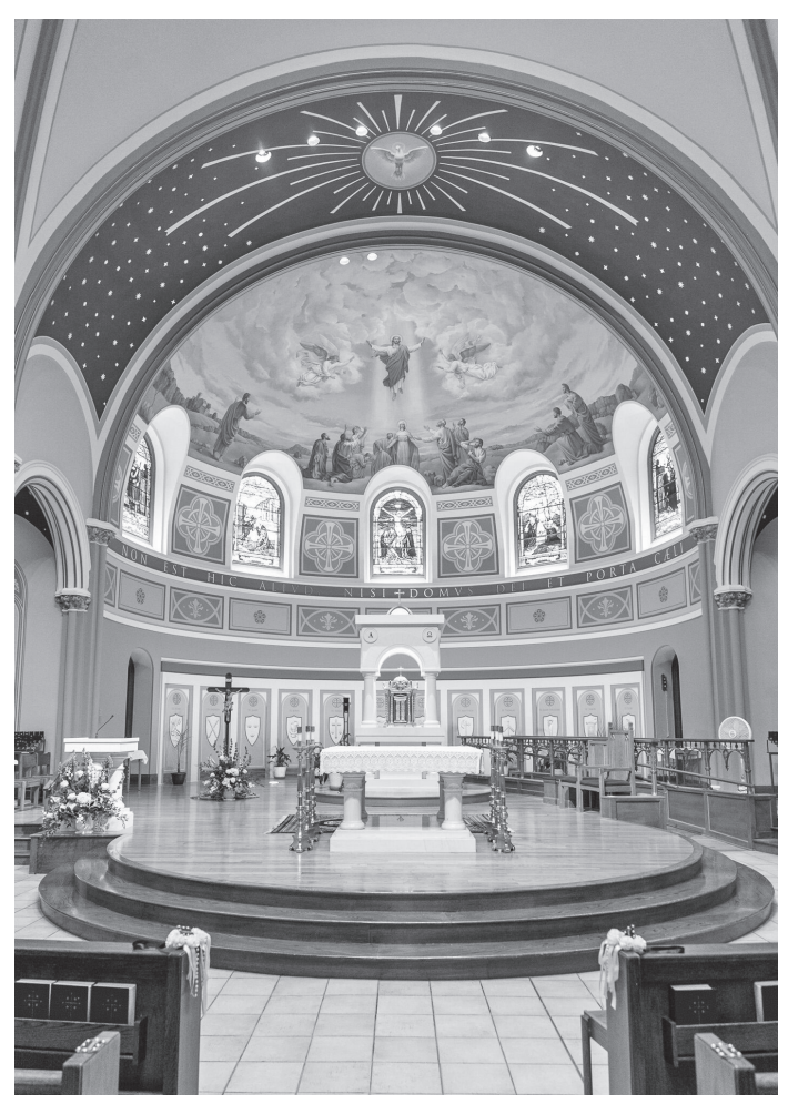
Figure 6. Closeup of restored sanctuary.

It's a rare event when three well-respected theologians — noted for their fidelity — team up to write against a timehonored practice of the Church. CHW have put their impressive academic skills, considerable intellectual gifts, and well-deserved scholarly reputations in service of . . . discouraging and even perhaps abolishing the Traditional Latin Mass forever, a Mass that likely only 1-2% of Catholics currently attend.