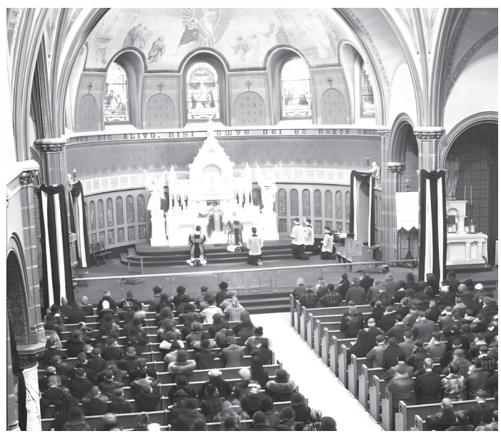
Figure 2. Solemn Requiem Mass for Pius XI, 1939.