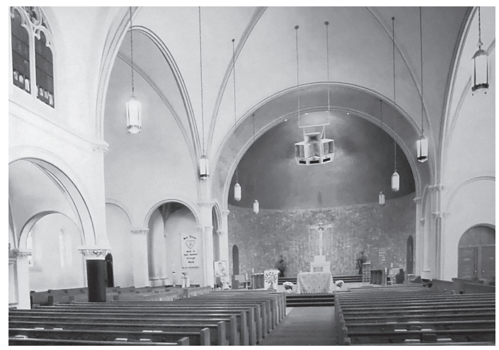
Figure 3. "Renovation" of the church after Vatican II, 1965.